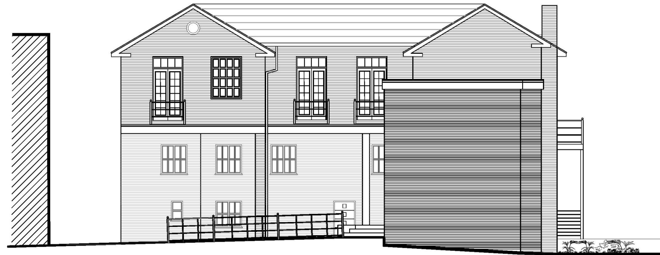
EXISTING REAR ELEV SCALE 1:100