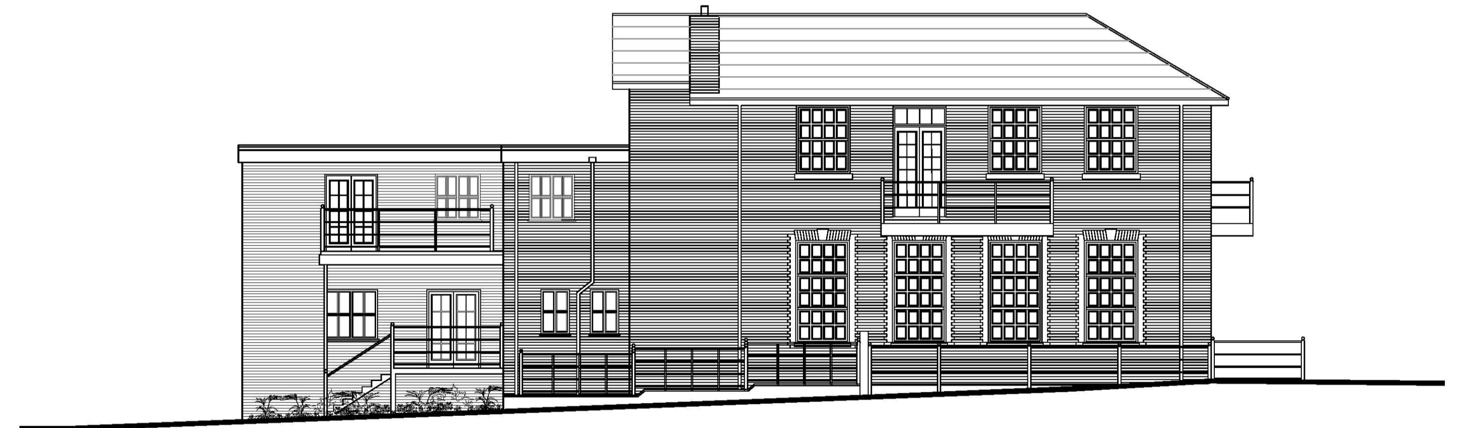
EXISTING WEST ELEV SCALE 1:100