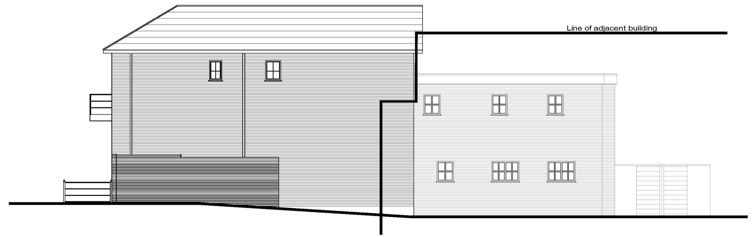
EXISTING EAST ELEV SCALE 1:100